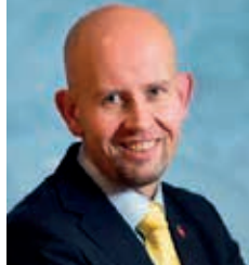
Tord Lien, Minister of Petroleum and Energy, Norway

Mission Innovation – The role of R&D in transforming the energy sector Kick Off (FME) CINELDI – Research Centre for intelligent electricity distribution – to empower the future Smart Grid