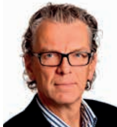
Auke Lont, CEO, Statnett

Nordic TSO cooperation and Security of supply